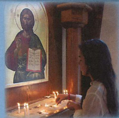
Psalm 5: 1-3